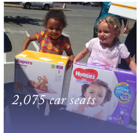
2,075 car seats