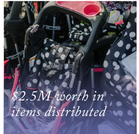
$2.5M worth in items distributed

We distributed over 100,000 more diapers in 2022, compared to the prior year. We attribute this to a growth in new bulk diaper partner sites, as we expand to more areas with limited resources.