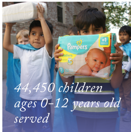
44,450 children ages 0-12 years old served