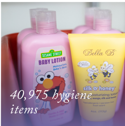
40,975 hygiene items