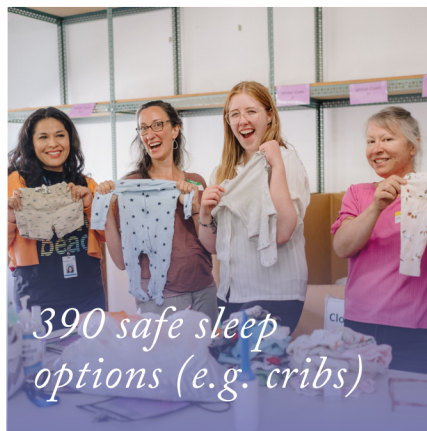
390 safe sleep options (e.g. cribs)

“These needed supplies really helps us stay connected with our clients.”